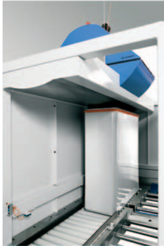
Can Transport System