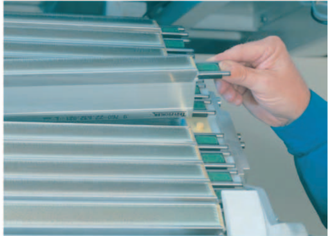
Trützschler 40" Revolving Flats