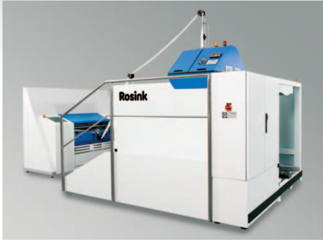
Machine Side View with Strip Delivery from TC 07