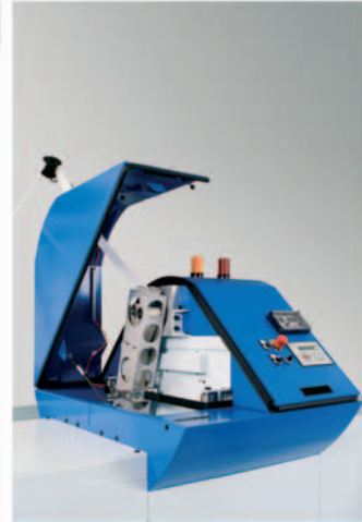
Oscillating Arm with Conveyor Belt