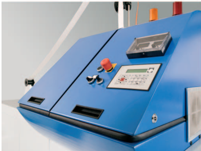
Machine Cover with Operating Area